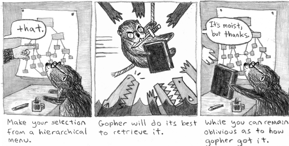
Figure 4. Cartoon strip from 1995 showing basics of Gopher information retrieval. File-menu design is depicted on paper tacked to wall. Information selected for retrieval is represented in the cartoon as a bound library book.

Because of these features, Gopher had some of the same problems as the Web. Users of both Gopher and Mosaic, for instance, were prone to feeling “lost in space,” especially when trying to recover particular information in a poorly remembered corner of cyberspace. 113 Both were subject to broken links—links to pages that no longer existed or had been moved. And both Gopher and the Web—products of an infinite number of individual decisions—had no formal mechanisms for propagating “mirrors” of popular information closer to home to better distribute the load. Again, the decision to abandon Gopher in favor of the Web was as emotional as it was rational. It was like an argument for metaphysics, impossible ultimately to prove or deny.